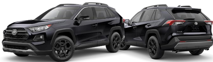
NEW TOYOTA RAV4 2W / AWD