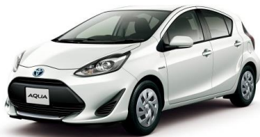
TOYOTA AQUA HYBRID

The above values are results from internal testing and are subject to change after validation. Please contact Japan Motors for detailed information on specs and availability of the specified models and colours.