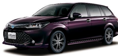
TOYOTA FIELDER WAGON