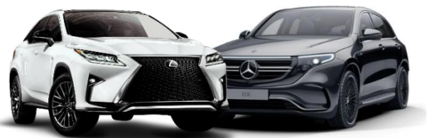
NEW LEXUS / MERCEDES BENZ