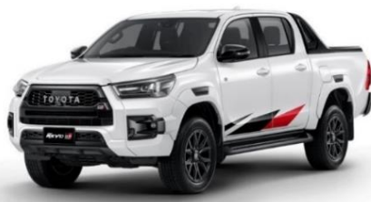
NEW TOYOTA HILUX GR SPORT