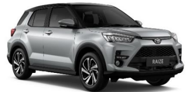
NEW TOYOTA RAIZE GAS/HYBRID